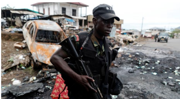
An elite Rapid Intervention Battalion member walks past a burnt car in Buea, Cameroon, on October 4, 2018.

increased violence and instability in Afghanistan remains a Tier I priority, fear of a new India-Pakistan military confrontation changed from a Tier II to a Tier III concern, and a potential China-India crisis over disputed territories was ranked a Tier III priority. Potential political instability in Pakistan, which had been a persistent concern in previous years, was not identified as a significant risk in the crowdsourcing phase and thus was not included in this year's survey.