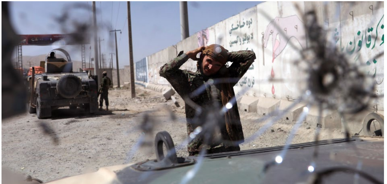
An Afghan National Army soldier keeps watch at a checkpoint on the Ghazni–Kabul highway in Afghanistan on August 14, 2018.

(CPA) at the Council on Foreign Relations has surveyed foreign policy experts for their collective judgments on these issues every year since 2008. After first soliciting the public for suggestions of potential developments in the coming year that warranted inclusion in the survey, we produced a list of the top thirty contingencies. We then asked survey respondents to assess each of the contingencies in terms of its likelihood and potential impact on U.S. interests. Given how subjective such judgments can be, we provided guidelines to help respondents evaluate each contingency in a consistent and rigorous fashion. The results were then aggregated and the contingencies sorted into three tiers of relative priority for preventive action.