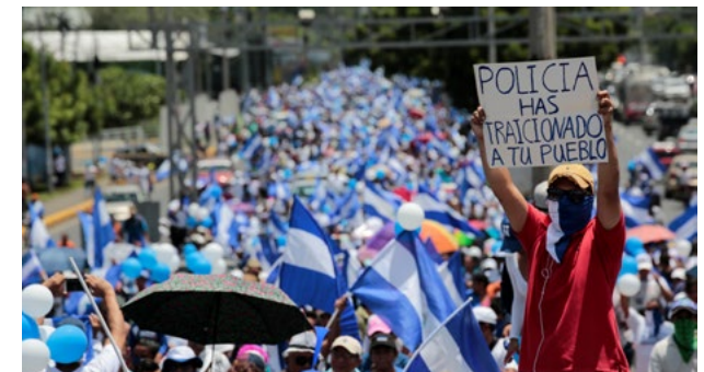
A protester holds a sign that reads "Police have betrayed your people" during a protest in Managua, Nicaragua, on September 16, 2018.