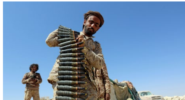
Yemeni tribesmen keep watch in Nihm District, on the eastern edges of Sanaa, on February 2, 2018.

The survey results were then scored according to their ranking, and the contingencies were subsequently sorted into one of three preventive priority tiers (I, II, and III) according to their placement on the accompanying risk assessment matrix.