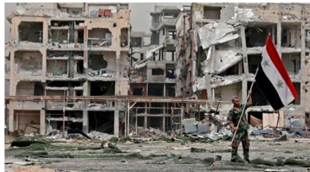
A member of the Syrian pro-government forces carries the national flag in the southern outskirts of Damascus on May 22, 2018.