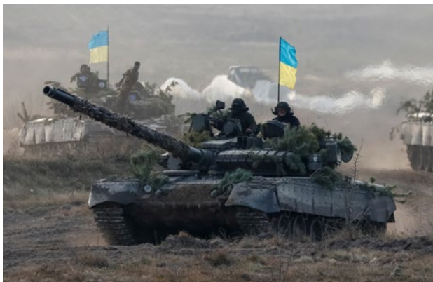
Ukrainian Air Assault Forces take part in military drills near Zhytomyr, Ukraine, on November 21, 2018.

With the dual goals of alerting U.S. policymakers to prospective international crises and helping them choose which ones to prioritize, the Center for Preventive Action